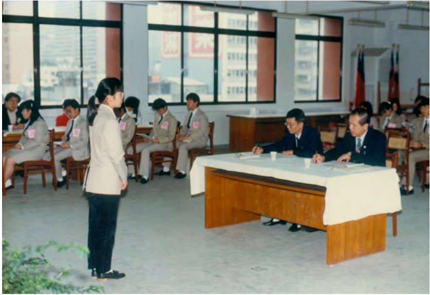
Test of basic competences: storytelling.