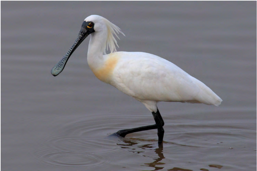
A black-faced spoonbill photographed at Niigata, Japan.

This poem mainly depicts the black-faced spoonbill, which is a threatened bird species in eastern Asia, by describing its characteristics while foraging, but the last lines also express dissatisfaction about its disappearing natural habitat. The black-faced spoonbill has a protected wintering site in Taiwan in the Qigu (Chhit-kó) 七股 region of Tainan: the Qigu Black-faced Spoonbill Reserve ( Qigu Heimian Pilu bao-huqu ) 七股黑面琵鷺保護區. 11 Based on the number of birds resting there every year from October till May, it is one of the most important wintering sites for this species in the world.