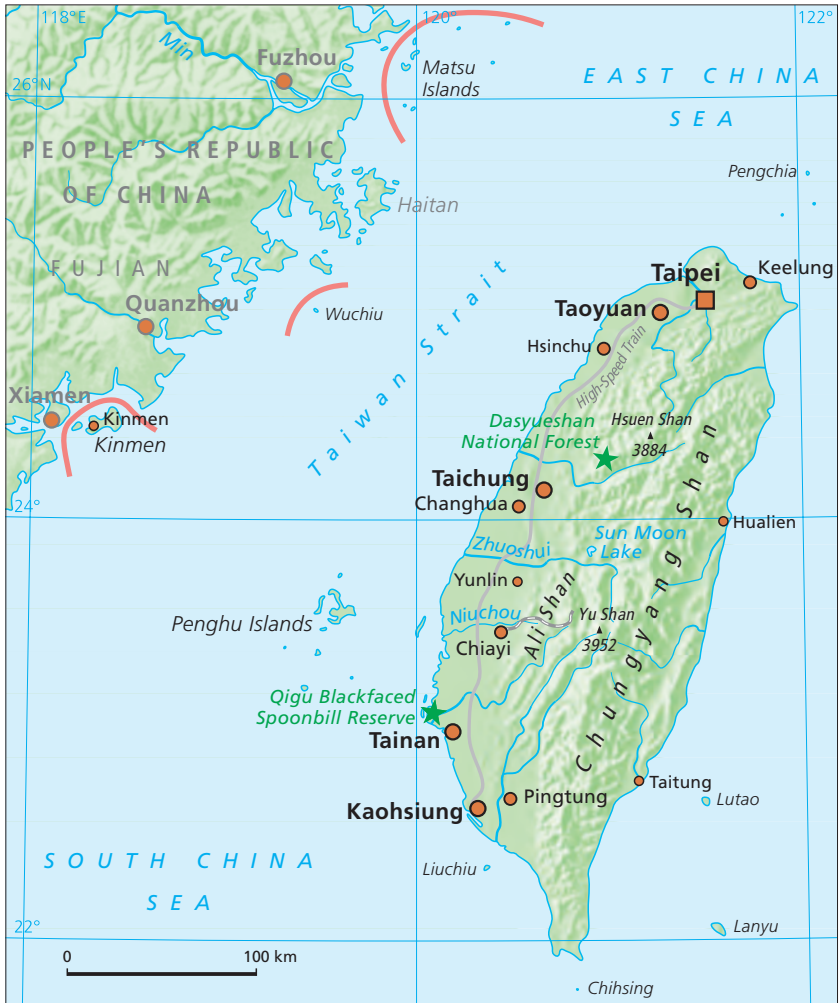
Map of Taiwan