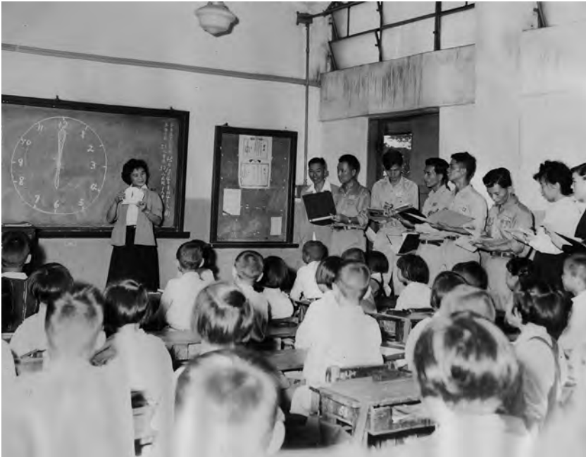
Students of Taipei Normal observing model teaching in a primary school (ca. 1950s).