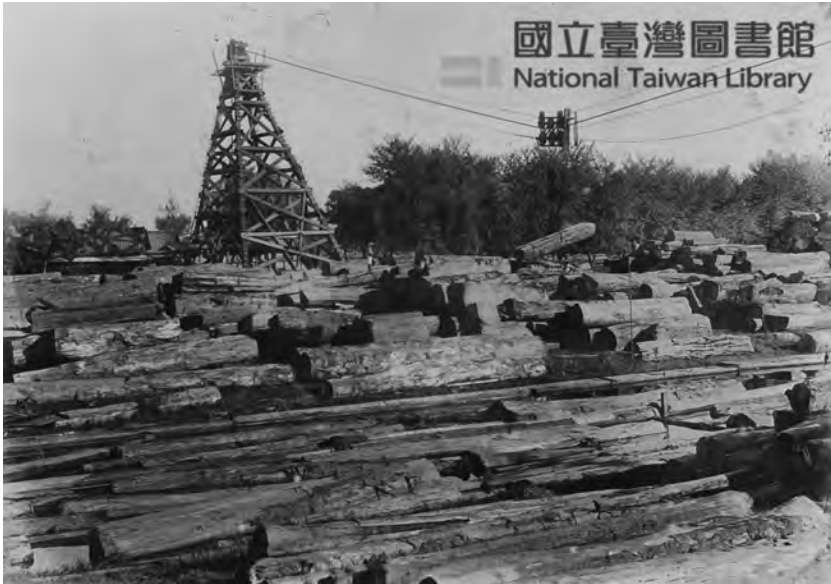
The Lumber Yard in Chiayi city 嘉義貯木場 (ca. 1930s).