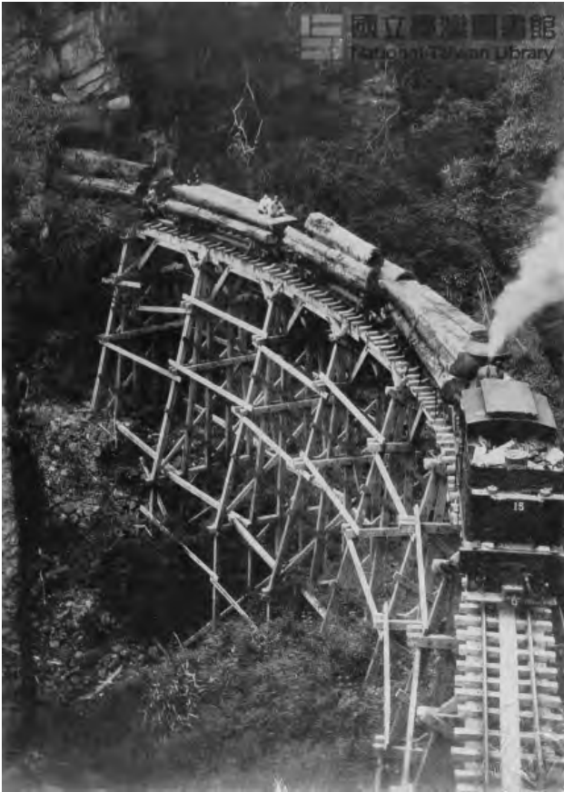
A Shay Locomotive with a Log Train at Alishan (1928).

nineteenth and early twentieth century. The demand for wood during the American western movement had caused Chicago to become a 'lumber city'. 3 William Cronon's critical discussion about Chicago provides a holistic view to think about the similarities and dissimilarities of the development of Chiayi city and the relationship between Chiayi and its surrounding countryside, especially the mountain area.