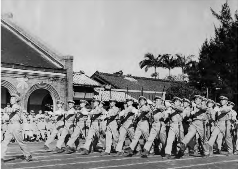
The parade of Taipei Normal's students (ca. 1950s).