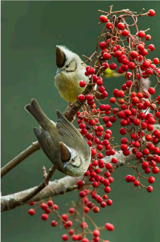
A pair of Taiwan yuhina photographed at the Dasyueshan National Forest.