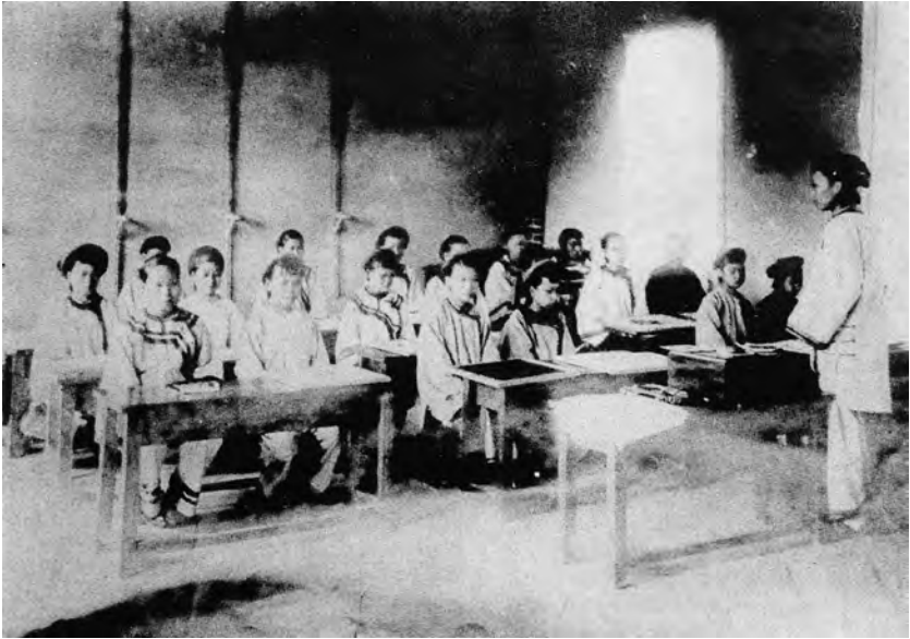
A girls' classroom of the Affiliated School of the Normal School (1908).